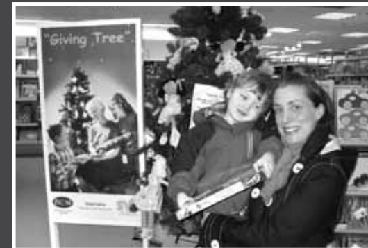
BCM Giving Tree

Though Christmas brings a special effort to meet people's needs, the work of BCM continues throughout the year. There is an ongoing programme, in Belfast and other towns, which includes advice on social and economic issues and several kinds of support services. Kirk House is a residential home for the elderly run by BCM, and through the 'LITE 60 plus' and Befriending project many others are given the support they need to remain living in their own homes. There is community care for young people and for families, support for people leaving care programmes and advice to underprivileged people of any age. The very successful Anderson House project, for example, now operates in four areas of Northern Ireland providing sheltered accommodation for young people coming out of care. The disappearance of the winter weather should remind everyone of the annual cross-community holiday programme! There are more specialist initiatives too, such as the support that is given to families with an autistic child.