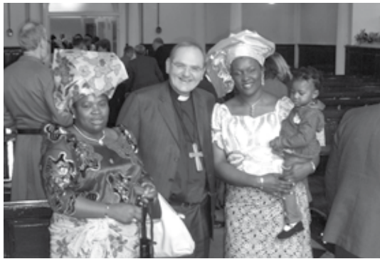
The President in Waterford Methodist Church, illustrating the international nature of Irish Methodism.

I think the most difficult challenge for us is to explore ways of making Christian faith mean something to people who just don't get it. And this will mean initiatives beyond the doors of our church buildings. Most of all we need to show that we are a community that cares for people and seeks to serve. The media story line throughout last year centred on how Christian Churches (not Methodist, I'm glad to say) had hurt their people. We need to demonstrate much more clearly that we are for healing, not hurting, and that we understand human need.