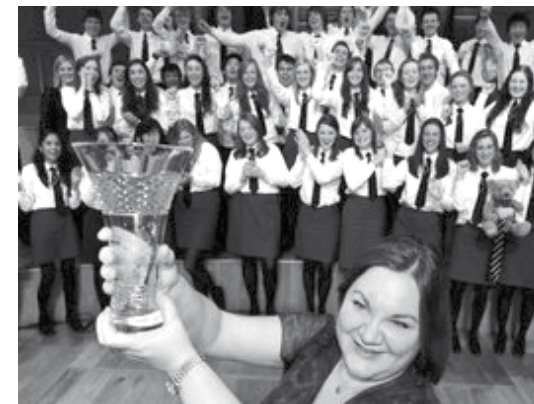
Award winning choirs from Methodist College.

The music included a variety of challenging pieces with demanding technical elements and all beautifully executed. Two of the Methody Choirs participated: - Methodist College Girls Choir and Methodist College Chapel Choir. The Girls Choir consists of 64 singers aged 14-18 years of age and they appear regularly on local and national radio and television. The girls are selected after competitive audition and rehearse three times a week. Both choirs had toured to the United States in 2010.