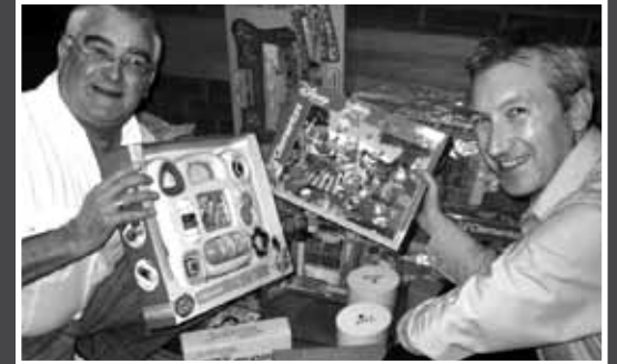
Sorting Presents donated by churches

Staff of the BCM have written to express their gratitude for gifts that enabled them to help needy people from the inner-city communities. Once again, Christmas 'Toy Services' at Seymour Street, Trinity, Broomhedge and Priesthill included the opportunity for children and their parents to give toys, clothing and food parcels. These were gratefully included in the 954 Food Parcels and 1960 Toy Parcels which were handed to people who otherwise receive few presents at Christmas. Despite the severe cold on Christmas Eve, the annual Belfast street collection raised almost £7600, and the intrepid collectors are thanked also.