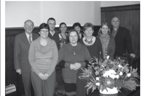
Some members of the Seymour Street Prayer Ministry Team after the Service of Dedication.

A prayer Ministry team has also been trained at Trinity and they are available to pray with those who wish support in this way at the end of the service on the last Sunday of each month.