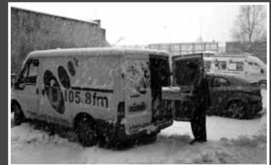
Delivering presents in the snow

BCM is one of Northern Ireland's oldest charities, being founded in 1889 as part of the Methodist Church's concern for the problems that were especially acute in inner city life. Over the years, such problems have persisted and the church's response is still needed. At the start of 2011 the BCM launched a programme to increase awareness of the work that it does, and also refreshed its image with a new logo. BCM is involved with all sectors of the community, irrespective of religious or political affiliation and their aim is to support those most in need in our society and enable them to reach their full potential.